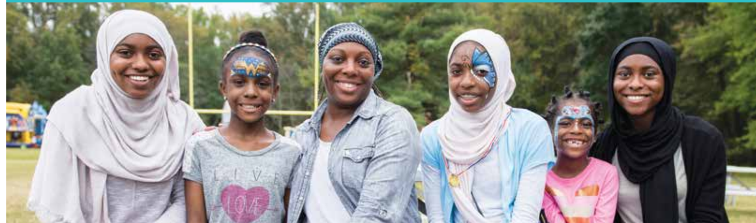
SUMMER CONCERT SERIES